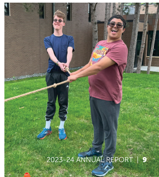
Tug of war to kick off a new school year.