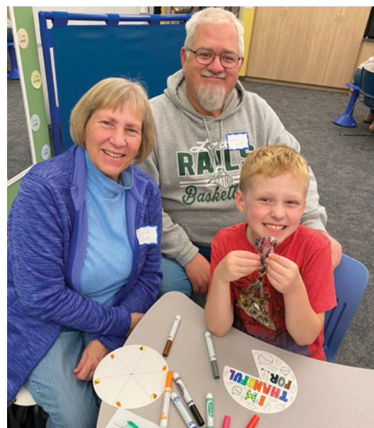
Special Person's Day is beyond special when you get to make an "I am thankful" wheel with your grandparents!