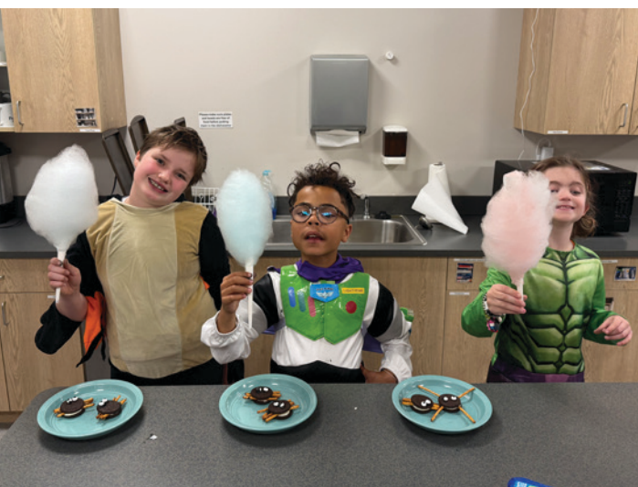
Creating some sweet treats while in costume adds even more fun to the learning.