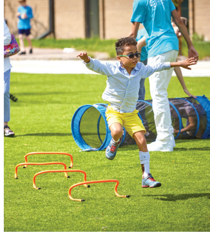
The obstacle course is no match for Academy students!