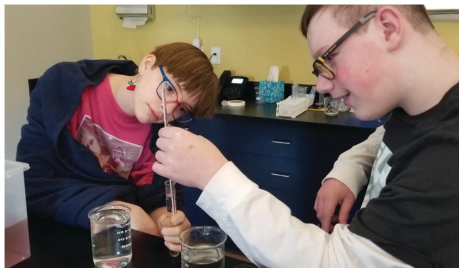
Students pair up to learn about precise liquid measurements in Science class.