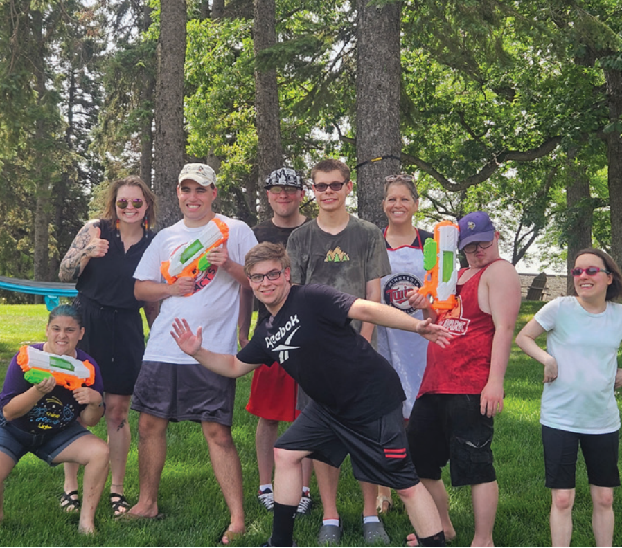
Capstone participants having fun at the Welcome picnic.